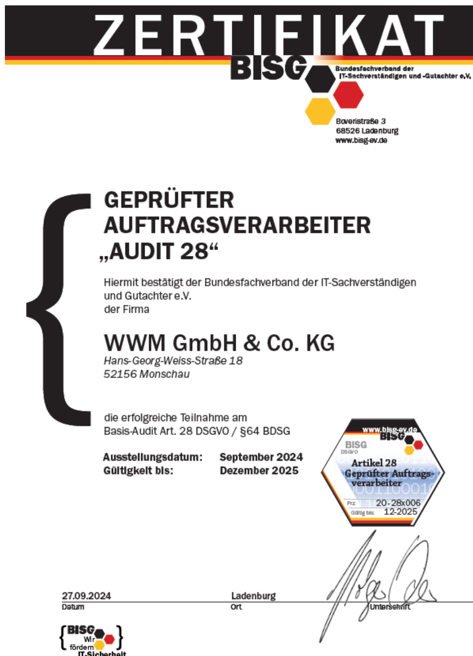
Illustration 1: Certification Audit 28

WWM is a certified data processor in accordance with Audit 28 of the Federal Association of IT Experts and Experts e.V.